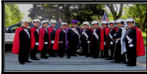
Our Knights in Regalia Hoffman Independence Day Parade